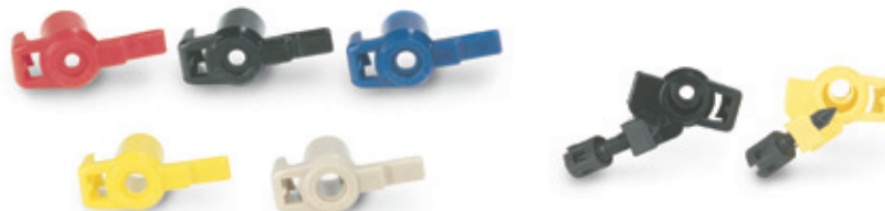
2045A Maxi-Paw Nozzles

Performance data derived from tests that conform with ASAE Standards; ASAE S398.1.